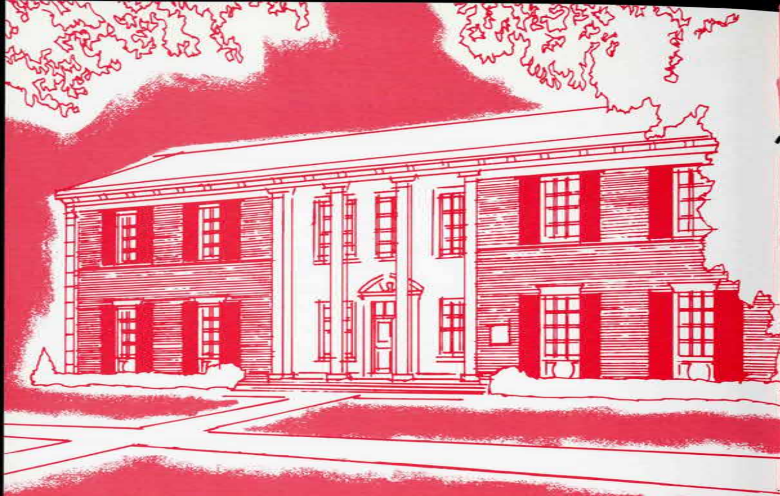
Academy Headquarters Building