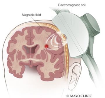
Figure 2. Repetitive transcranial magnetic stimulation. In transcranial magnetic stimulation, an electromagnetic coil placed against the scalp creates a magnetic field that stimulates certain areas of the brain.