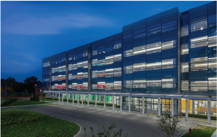
Right: The Livingston Ambulatory Center offers Adolescent Medicine, Behavioral Health, The Center for Healthy Weight and Nutrition, Dental Clinic, Laboratory services, Physical Therapy and more.