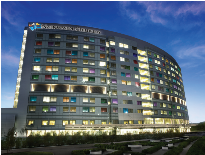
Our hospital cares for over a million patients every year.