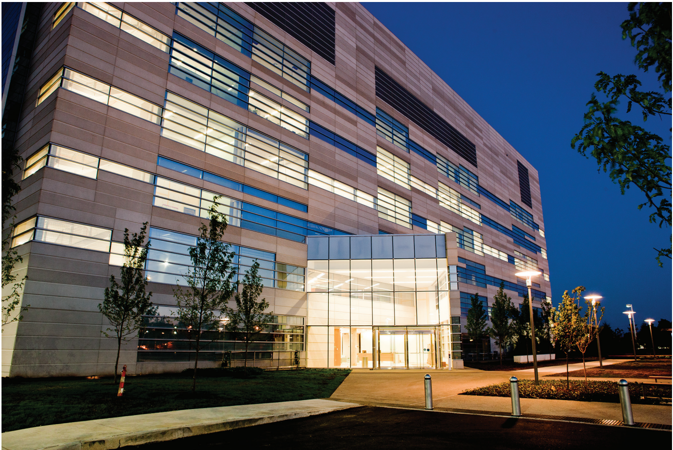
Our third research building consists of 225,000 square feet and six floors of state-of-the-art bench laboratory space, sophisticated support facilities and ample office, support and administrative space. This adds to 375,000 square feet of existing research space.