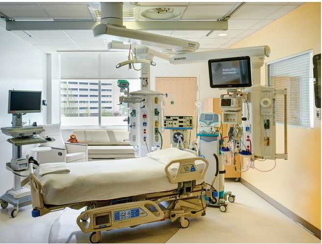
Critical care rooms have the latest technology to optimize clinical practice and patient safety.